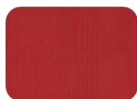
902 - Red