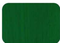
903 - Green