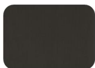
908 - Black